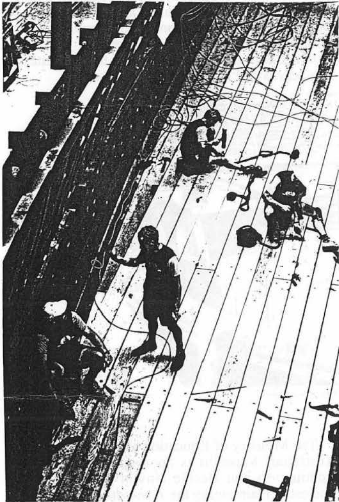
Caulking the lower deck.

To comply with the museum replica ethic, the 20th Century fit must intrude as little as possible upon the ship's design and appearance. Consequently, as far as possible, the 20th century is installed below the lower deck level and out of the public gaze.