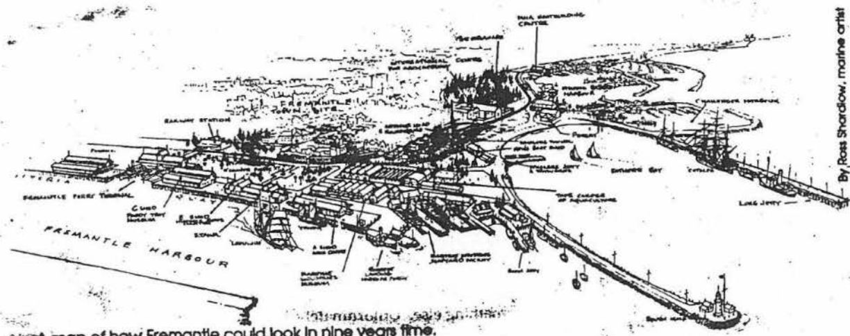
A map of how Fremantle could look in nine years time.